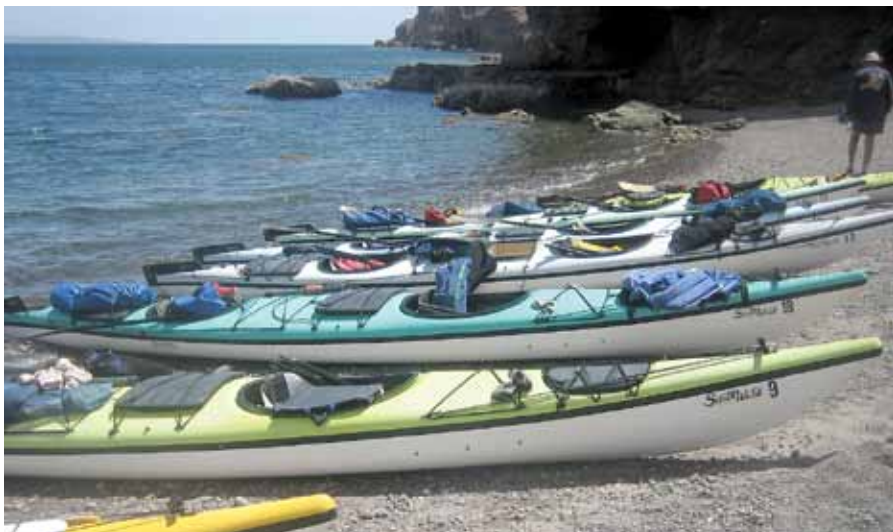
Our island hoppers parked at a remote, lovely beach.

calm sea. Soon the sun rises and the rays of light warm my skin. I am ready to start the day.