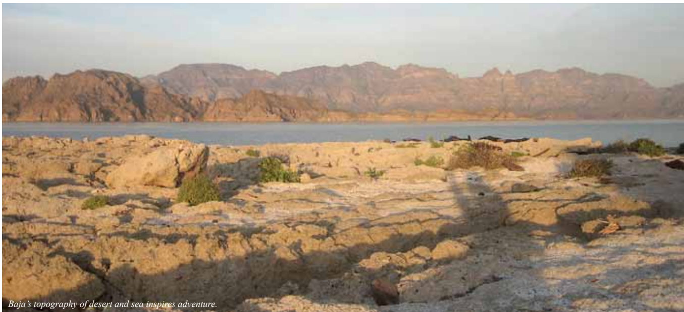
Baja's topography of desert and sea inspires adventure.